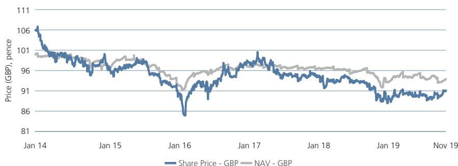
Share price and Net Asset Value (NAV) movement is representative of GBP. Past performance is not a reliable indicator of future results. Source: U.S. Bank Global Fund Services (Guernsey) Limited and Bloomberg.