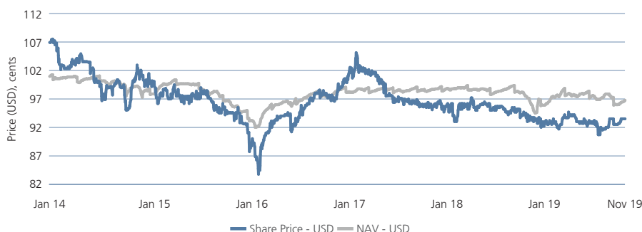
Share price and Net Asset Value (NAV) movement is representative of USD. Past performance is not a reliable indicator of future results. Source: U.S. Bank Global Fund Services (Guernsey) Limited and Bloomberg.