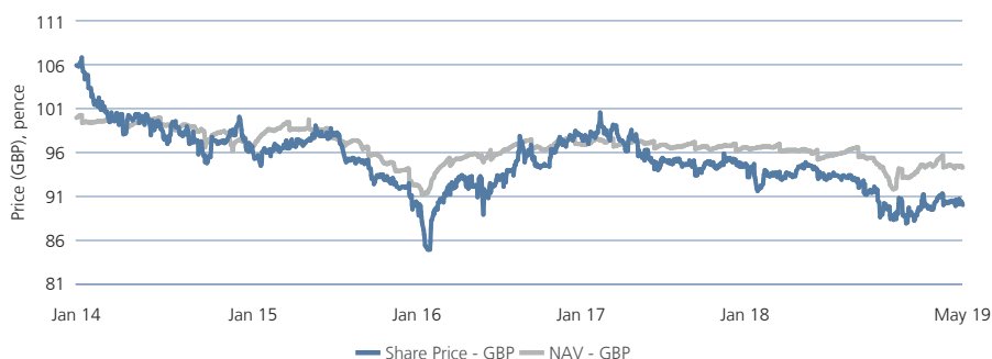
Share price and Net Asset Value (NAV) movement is representative of GBP. Past performance is not a reliable indicator of future results.