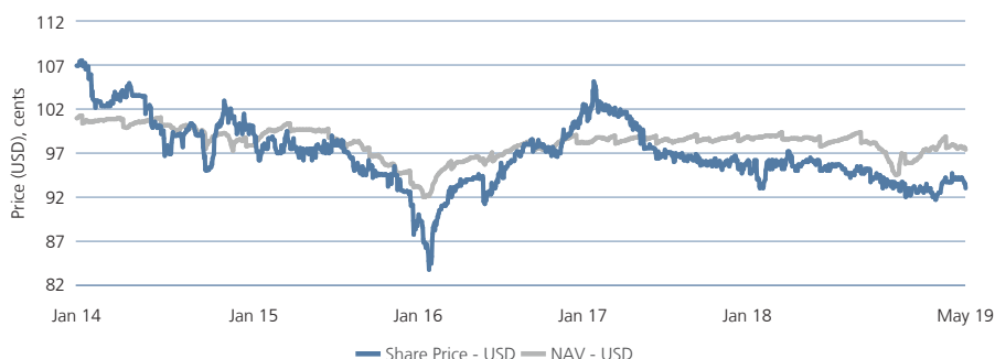
Share price and Net Asset Value (NAV) movement is representative of USD. Past performance is not a reliable indicator of future results.