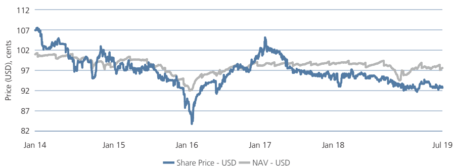
Share price and Net Asset Value (NAV) movement is representative of USD. Past performance is not a reliable indicator of future results.