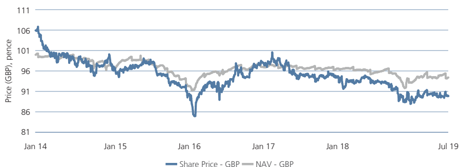
Share price and Net Asset Value (NAV) movement is representative of GBP. Past performance is not a reliable indicator of future results. Source: U.S. Bank Global Fund Services (Guernsey) Limited and Bloomberg.