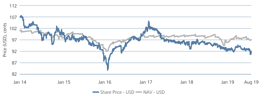
Share price and Net Asset Value (NAV) movement is representative of USD. Past performance is not a reliable indicator of future results.