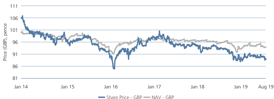
Share price and Net Asset Value (NAV) movement is representative of GBP. Past performance is not a reliable indicator of future results. Source: U.S. Bank Global Fund Services (Guernsey) Limited and Bloomberg.